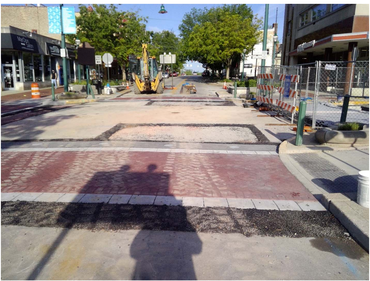
Opened up 3 legs, Washington St., Intersection on Wednesday. North leg left closed while the concrete cures until Monday, 5/11.