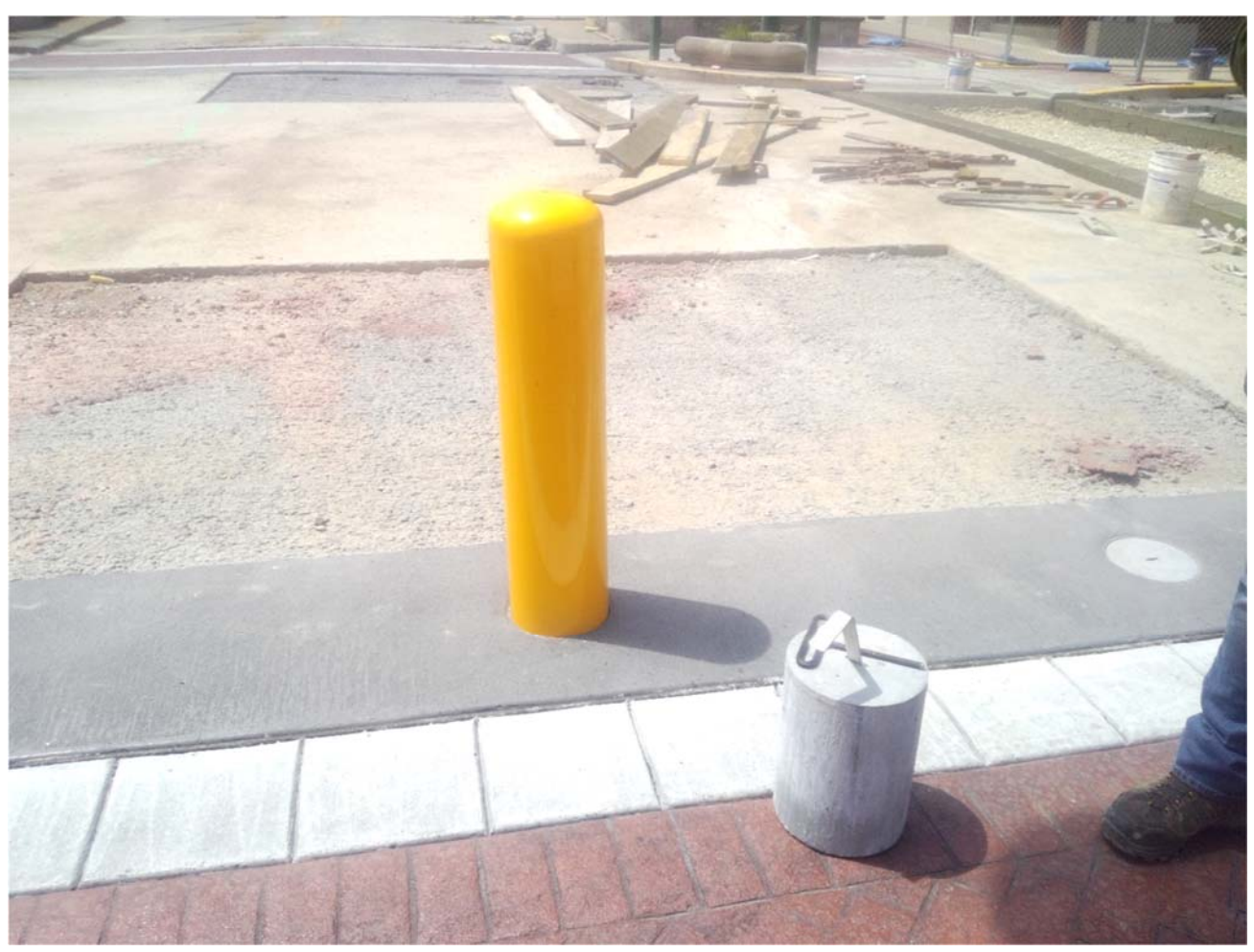
An example of how a bollard change is accomplished.