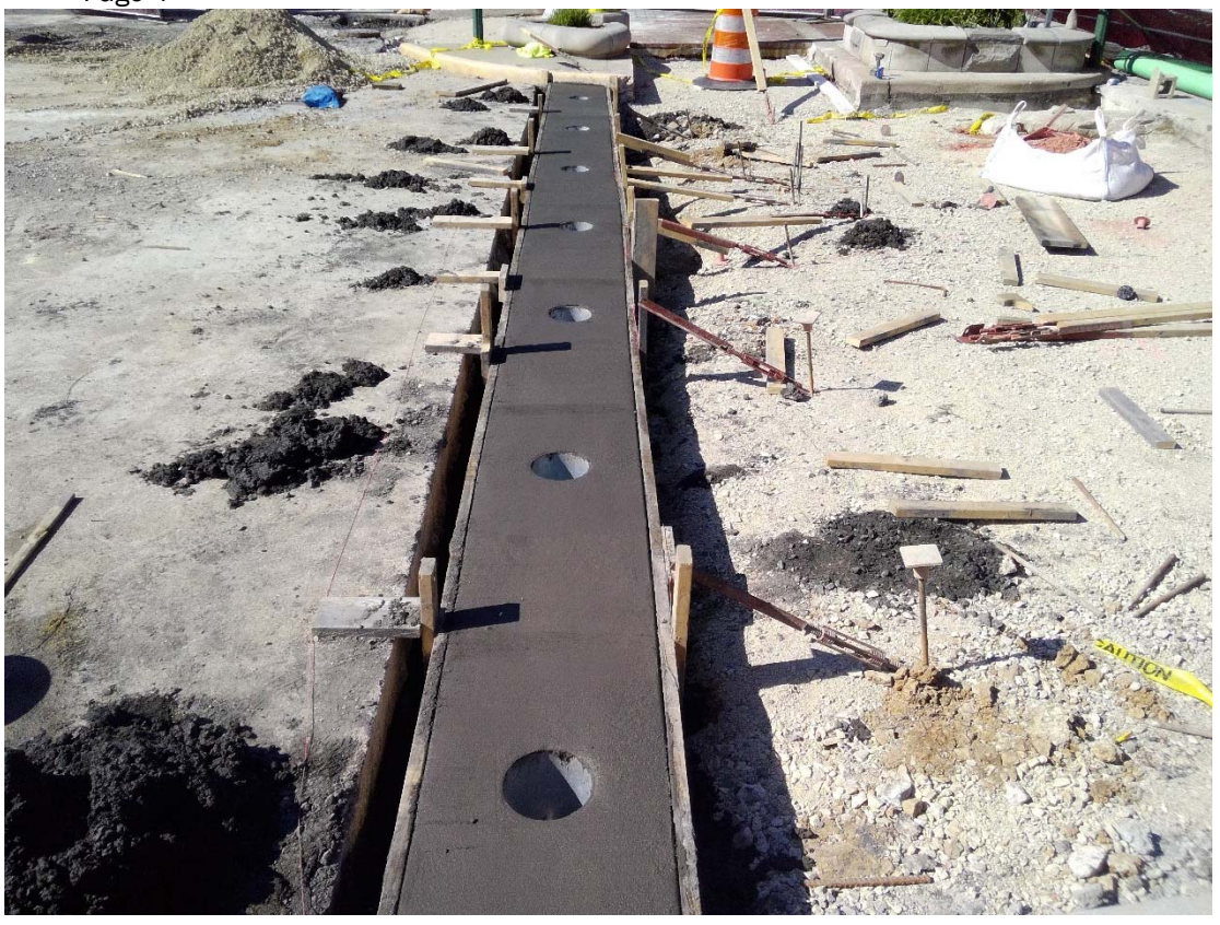
Bollard footer recently constructed at Dunn St., Intersection, East leg.